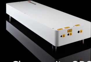
Chromacity OPO (Auskerry and Haskeir)