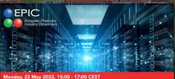
Monday, 23 May 2022, 15:00 - 17:00 CEST EPIC Online Technology Meeting on Co-packaged Optics for Hyperscale Datacenters