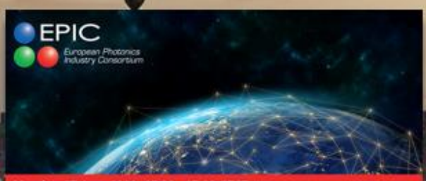
Monday, 27 June 2022, 15:00 - 17:00 CEST EPIC Online Technology Meeting on Quantum Communication and QKD