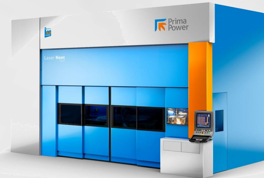
LASER NEXT 2141