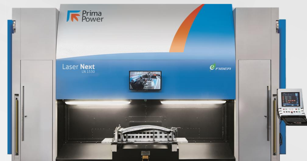
LASER NEXT 1530/2130