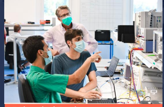
RF Electrical Testing