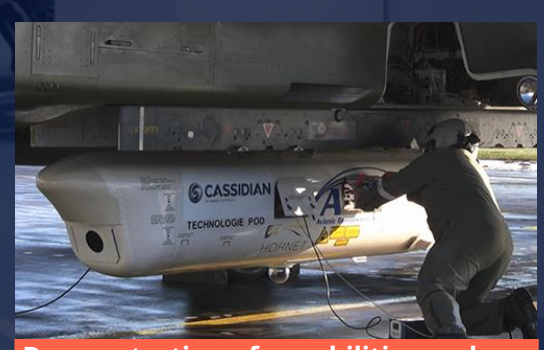
Demonstration of capabilities under extreme conditions (fighter aircraft)