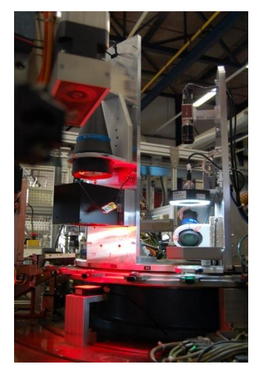
High precision p&p