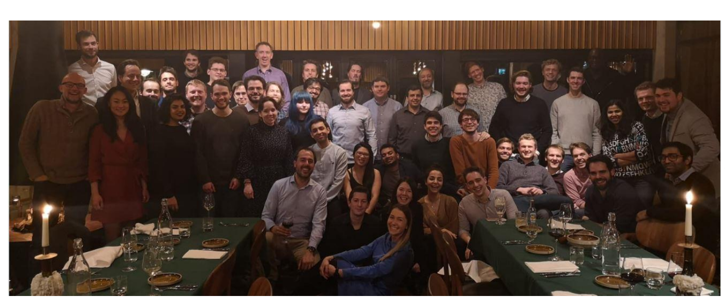
Team – 55 and growing