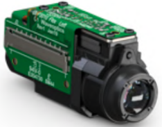
40° projector (SATURN) is available today.