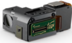
28° projector (MARS) available in Q1 2020