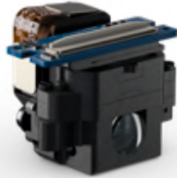
55° projector (PLUTO) Built initially to support our Ultra-High Field of View demos